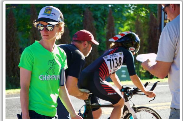
Get aero and fly through the valley's farmlands. OBRA TT Rules apply for the Stage 1 Coburg TT.

TT will be a National Senior Games Qualifier. Results submitted for racers aged 50 and over in five year age groups (50-54, 55-59, etc.), regardless of TT category.